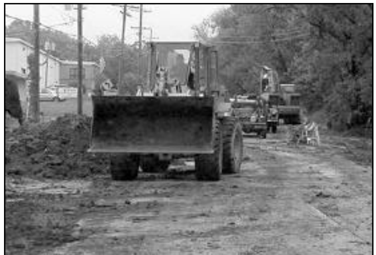
Crews work on reconstructing Lake Marian Road